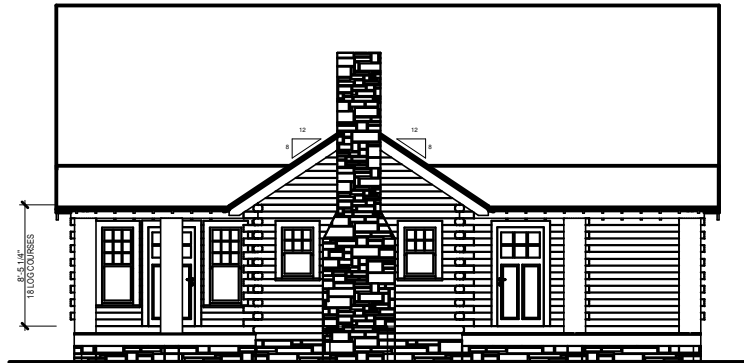
LEFT ELEVATION 1/4" = 1'-0"